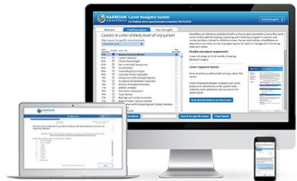
Online Interactive Career Portal